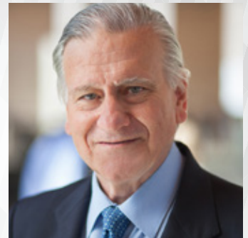
Valentin Fuster, MD, PhD, MACC

Instituto do Coração (InCor)/HCFMUSP Main Auditorium Av. Dr. Enéas de Carvalho Aguiar, 44 Pinheiros - São Paulo, Brazil